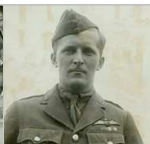
Off to France